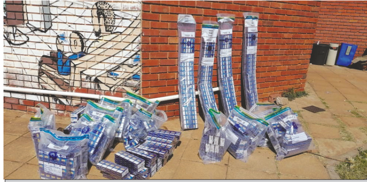
The police recovered illicit cigarettes during the weekly joint operations conducted across the province.

cally approached the said house and upon searching the two suspects and the house, police recovered one unlicensed firearm and illicit cigarettes loaded in a Toyota Camry. They were immediately nabbed," he said. Ledwaba indicated that one of the suspects' relative approached the police offered them R5000-00 to release his relatives and he was also arrested. "During the operations, the police recovered a total number of 7830 counterfeit cigarettes sticks, 25 dangerous weapons, large quantity of dagga, drugs that included Crystal Meth, Nyaope, and 15 firearms, large quantity of liquor and 21 knives. Five stolen or robbed vehicles were also seized during these operations. The operations are still ongoing," he said. Ledwaba said the suspects have started appearing before various magistrate's courts in the province facing offences including possession of unlicensed firearms and ammunition, illegal hunting, murder, attempted murder, rape, fraud, possession and dealing in drugs, common robbery, possession of suspected stolen property, Contravention of Immigration Act and possession of illicit cigarettes. The Provincial Commissioner of the Police in Limpopo, Lieutenant General Thembi Hadebe, has praised the police teams for arresting the suspects and keeping the province safe.