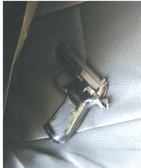
The illegal firearm that was recovered by the police in possession of the suspects during their arrests on the R25 Road in Dennilton.

to any acts of criminality. "The firearm had serial numbers filed off and it will be subjected to ballistic investigations to determine if it was previously used in the commission of other serious crimes," he said. Ledwaba said the suspects were granted R800-00 bail each and will be appearing again on 5 September 2022, following further police investigation. The Provincial Commissioner of the Police in Limpopo, Lieutenant General Thembi Hadebe, praised the members for arresting the suspects and fearlessly performing their daily activities of keeping the citizens of this province safe.