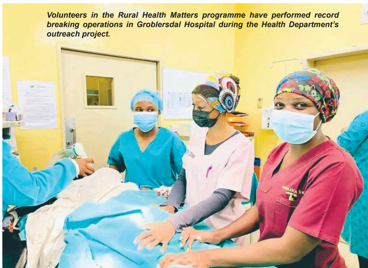
Volunteers in the Rural Health Matters programme have performed record breaking operations in Groblersdal Hospital during the Health Department's outreach project.