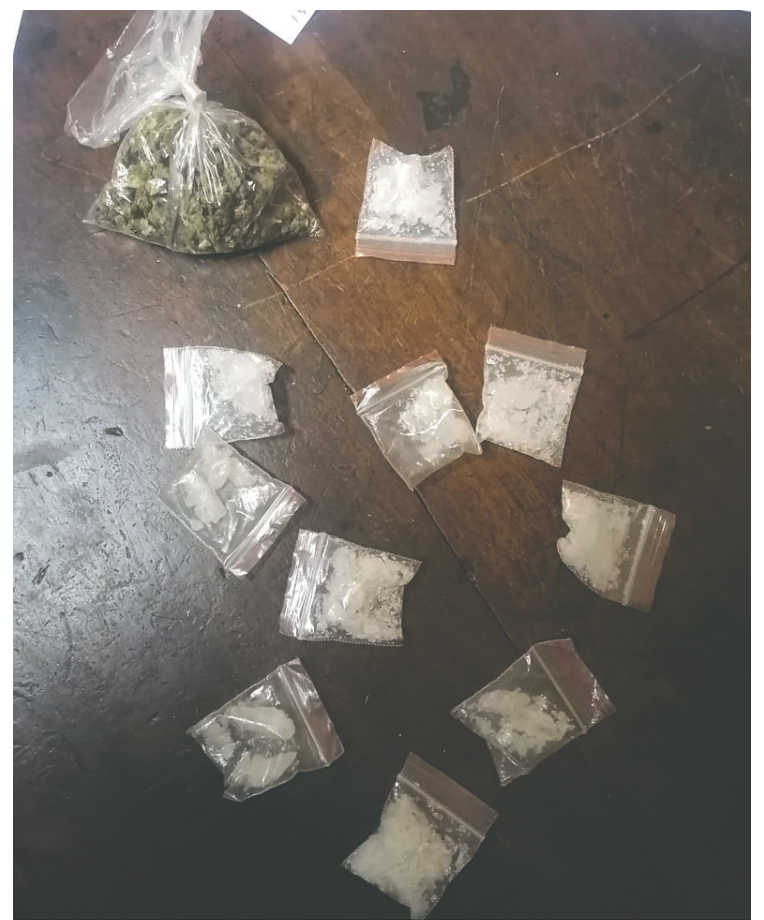
The drugs that were found by the police in possession of the suspects during the Limpopo Provincial Weekly Operations, aiming at cracking down on criminals across the province.