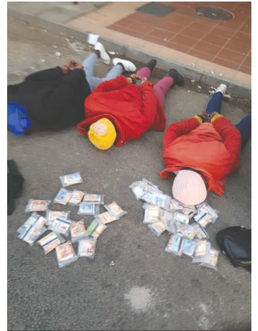
The Motetema Police arrested three suspects in connection with burglary and fraud related crimes committed in the area.