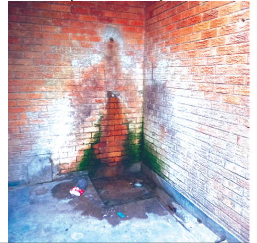
The DA in Ephraim Mogale Local Municipality has reported the inhuman conditions at Marble Hall Police Station to the SAHRC.